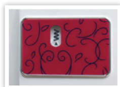
CLEAR AND EASY STITCH SELECTION

Key Features Elegant, yet sturdy, the HD718 offers a variety of stitches, accessory feet and functions to take you beyond the basics and through any sewing task.