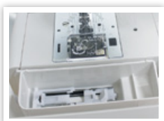
CONVENIENT ON-BOARD STORAGE