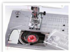
EASY SET BOBBIN

Key Features The M100 QDC features a varied selection of stitches for fashion, quilting and home décor. Auto thread trim, abundant accessories and a lightweight, yet solid metal frame make this a great all around machine for class and travel.