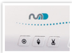
CONVENIENCE: AUTO THREAD CUTTER