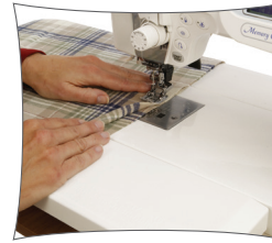
Wide Open Spaces: 9" to right of needle