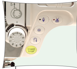
Easy Convenience Buttons