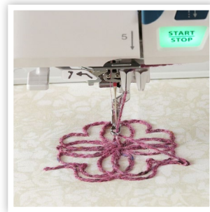
EMBROIDERY COUCHING FUNCTION