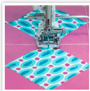
ACUFEED™ FLEX LAYERED FABRIC FEEDING SYSTEM