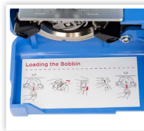
BOBBIN INSERTION GUIDE FOR EASY REFERENCE