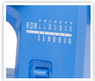
15 BUILT-IN STITCHES