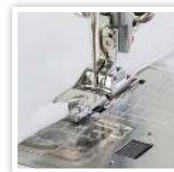
Rolled hem foot