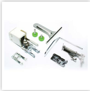
QUILTING SET INCLUDED