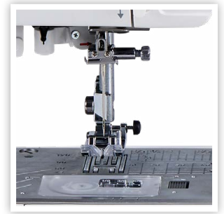
SUPERIOR PLUS FEED SYSTEM WITH 7-PIECE FEED DOG