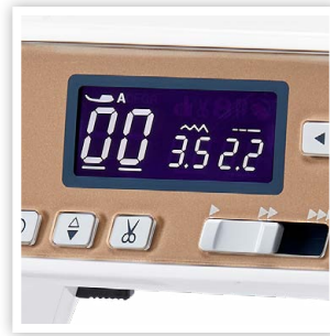
LCD SCREEN WITH HANDY FUNCTION KEYS