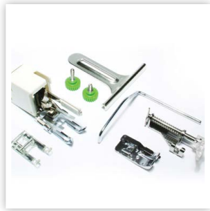
QUILTING KIT INCLUDED