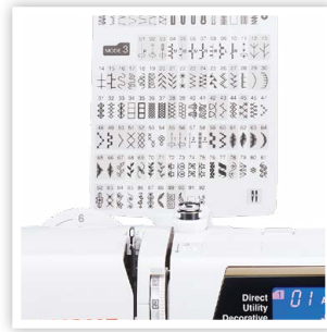
DETACHABLE STITCH CHART