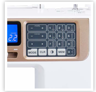
MANY CONVENIENT FEATURES