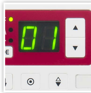
LED WITH EASY NAVIGATION KEYS