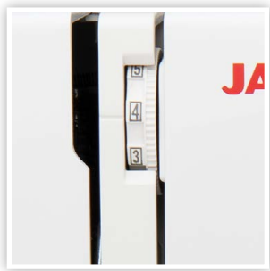
ADJUSTABLE THREAD TENSION