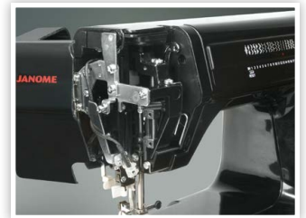
SOLID HEAVY DUTY CONSTRUCTION