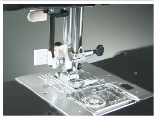
NEEDLE THREADER AND DROP IN BOBBIN