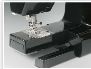
FREE ARM SEWING