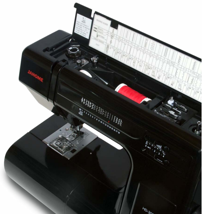
HANDY ACCESSORY STORAGE AND REFERENCE GUIDE