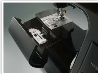
CONVENIENT STORAGE COMPARTMENT