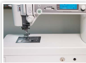
10" ALL METAL SEAMLESS FLATBED