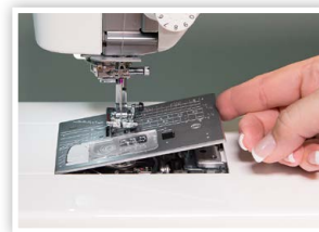
ONE-STEP NEEDLE PLATE CONVERSION