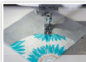
INDUSTRIAL INSPIRED HP FOOT AND PLATE