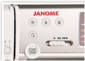
1200 SPM - FASTEST TOP LOADING BOBBIN IN THE INDUSTRY