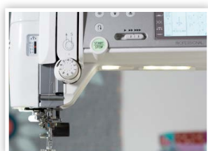
STREAMLINED SHAPE AND ENHANCED LIGHTING