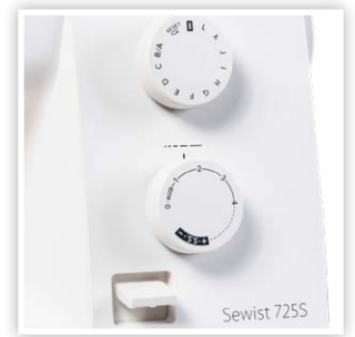
HANDY STITCH CONTROLS