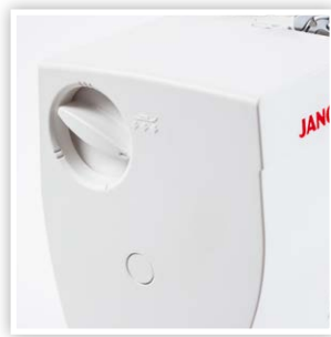
EASY ACCESS FOOT PRESSURE DIAL