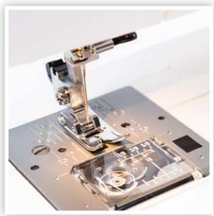
PATENTED NEEDLE PLATE MARKINGS