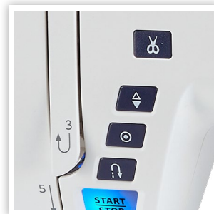
AUTOMATIC THREAD CUTTER