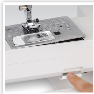
ONE-STEP NEEDLE PLATE CONVERSION