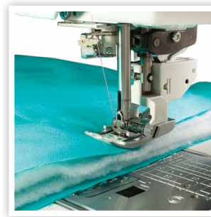
ACUFEED FLEX LAYERED FABRIC FEEDING SYSTEM