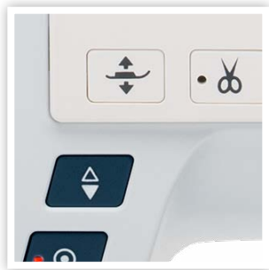
AUTOMATIC PRESSER FOOT LIFT