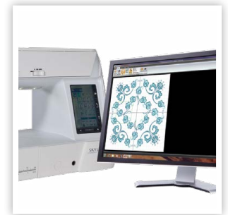
STITCH COMPOSER STITCH CREATION PROGRAM