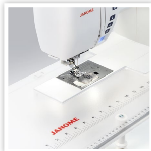
EXTENSION TABLE INCLUDED