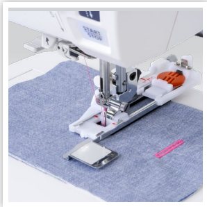
10 ONE-STEP BUTTONHOLES, 9 MM STITCHES