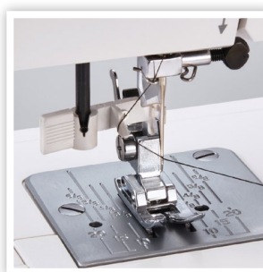
BUILT-IN NEEDLE THREADER