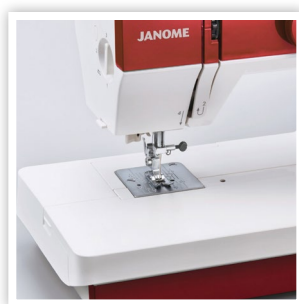
EXTRA WIDE SEWING AREA