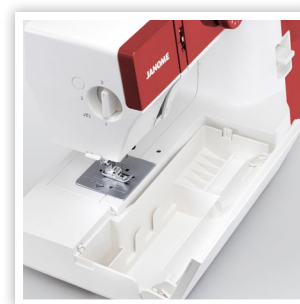
LARGE OPEN-TOP STORAGE COMPARTMENT