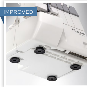
VIBRATION DAMPENING RUBBER FEET