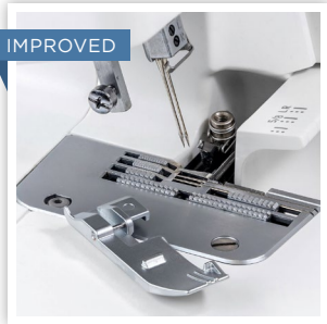
PRESSER FOOT, 8 PIECE FEED DOGS