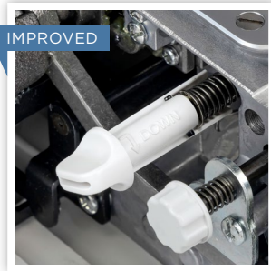
UPPER KNIFE RELEASE OPERATION