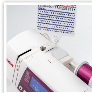
ADJUSTABLE STITCH CHART