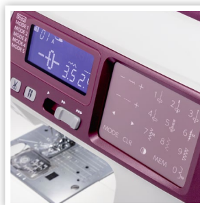
ENHANCED LCD WITH TOUCH PAD