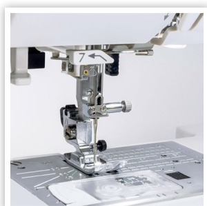
SUPERIOR NEEDLE THREADER WITH THREAD GUIDE 7