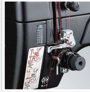
ADJUSTABLE THREAD GUIDE