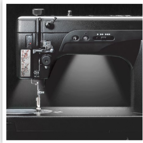
BRIGHT LED LIGHTING, TWO LOCATIONS