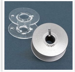
HIGHER CAPACITY BOBBIN (1.4X LARGER)