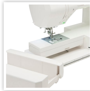
ACCESSORY STORAGE AND FREE ARM SEWING