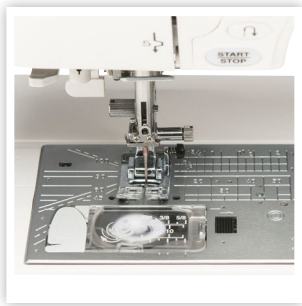
9 MM STITCHES AND ACUFEED™ FLEX SYSTEM