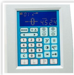
INTUITIVE TOUCH CONTROL PANEL