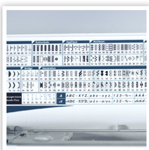
240 BUILT-IN STITCHES