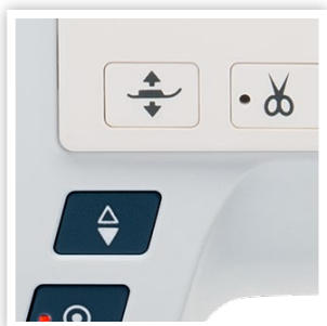
AUTOMATIC PRESSER FOOT LIFT