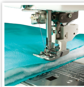
ACUFEED FLEX LAYERED FABRIC FEEDING SYSTEM